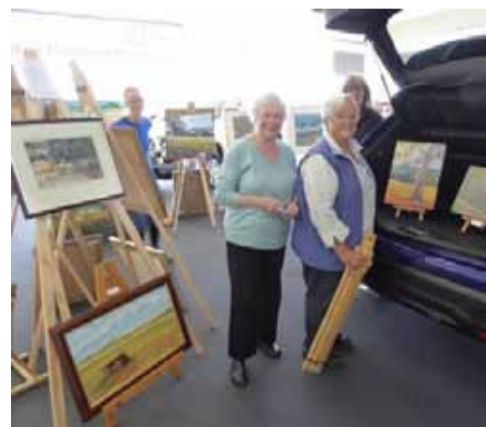
Eclectic Art Group

Take five talented Australian performers, add dash of opera and a slice of cabaret with a topping of Broadway - all served with stunning voices in Warragul's finest music venue.