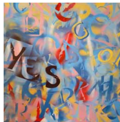
Colour My World