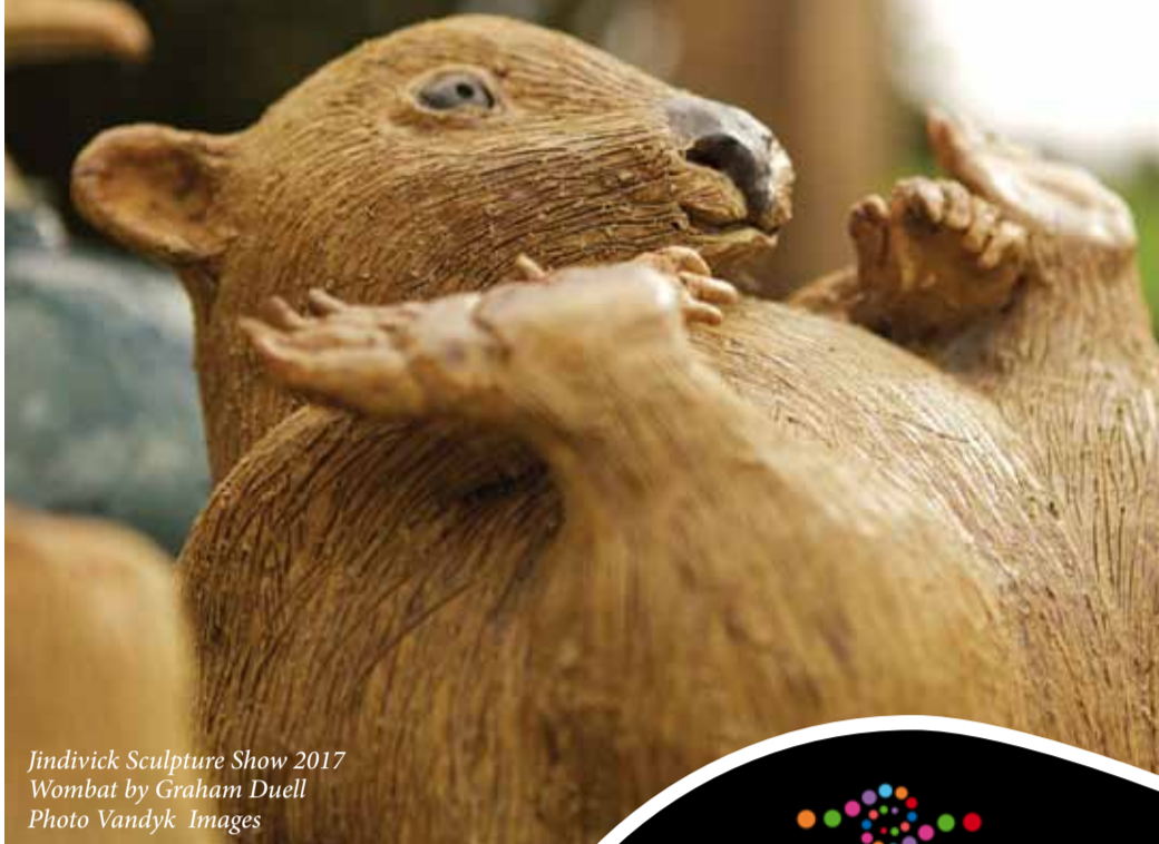
Jindivick Sculpture Show 2017 Wombat by Graham Duell