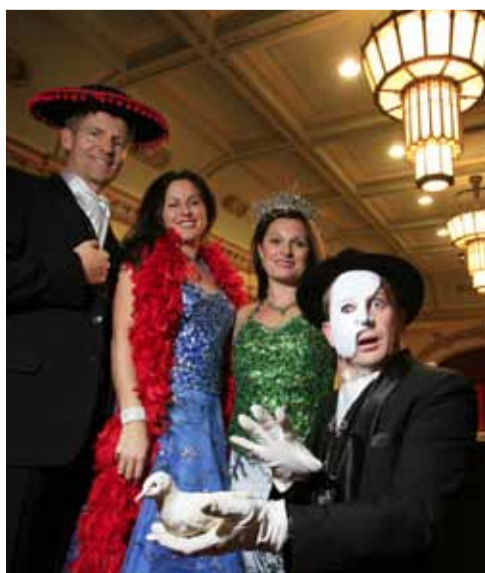
From Figaro to Phantom (Pot-Pourri)